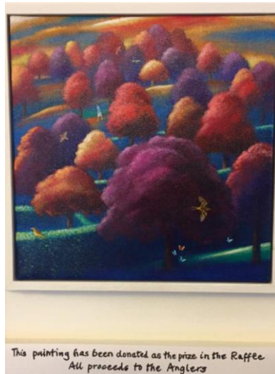
This painting has been donated as the prize in the Raffle. All proceeds to the Anglers